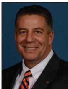
Bruce Pearl Head Coach First Year at Auburn 20th Year Overall